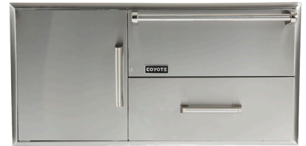
CCD-WD 42" COMBO WITH WARMING DRAWER - Electric heating element (400 watt) - Temperature range of 90° F - 250° F