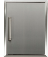
CSA2014 20"X14" SINGLE DOOR