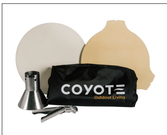
ASADO-ACC ACCESSORY BUNDLE

When the Asado has cooled and is not in use, cover it with an Asado rain cover for extra protection.