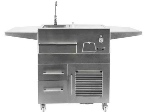
C2UNCT with REFRESHMENT CENTER