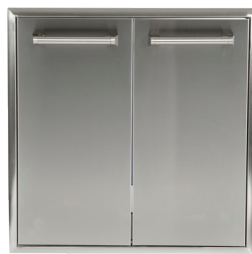
CTC 27" DUAL PULL OUT TRASH & RECYCLE