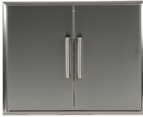
CDA2431 24" X 31" DOUBLE DOOR