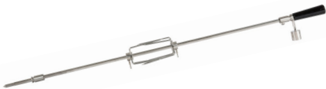
CROT - ROTISSERIE KIT