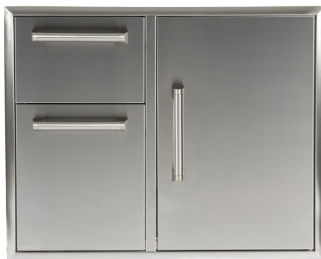
CCD-2DC31 31" COMBO DOOR/DRAWERS