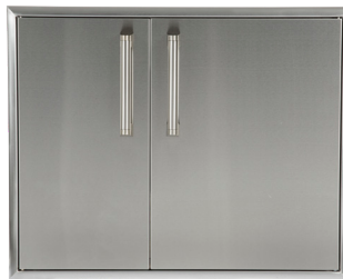
CDPC31 31" DRY PANTRY WITH DRAWERS