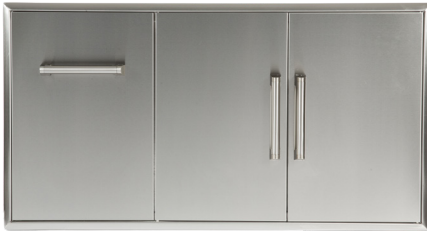
CCD-POD 45" COMBO DOORS/DRAWER

All cabinets are made of rigid, premium stainless steel with a consistent beveled trim and professional handles. All drawers use easy open rollers.