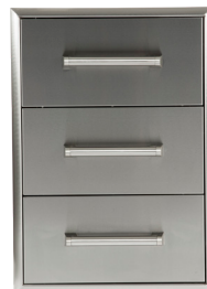
C3DC 17" W THREE-DRAWER CABINET