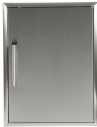
CSA2417 24"X17" SINGLE DOOR