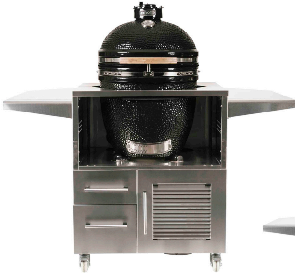
C2UNCT with ASADO