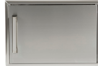
CSA1420 14"X20" SINGLE DOOR