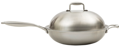
CWOK - WOK