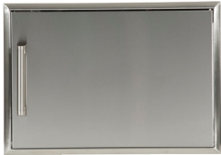
CSA1724 17"X24" SINGLE DOOR

All access doors are made of rigid, premium 304 stainless steel with a consistent beveled trim and professional handles.