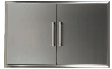
CDA2439 24" X 39" DOUBLE DOOR