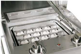
BRIQUETTE TRAY WITH ELEMENT