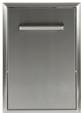
CPOD PULLOUT DRAWER Holds standard propane tank