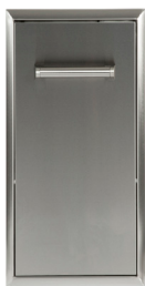
CSTC 14" SINGLE PULL OUT TRASH & RECYCLE