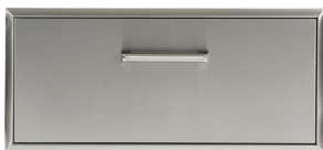
CSSD 30" storage drawer