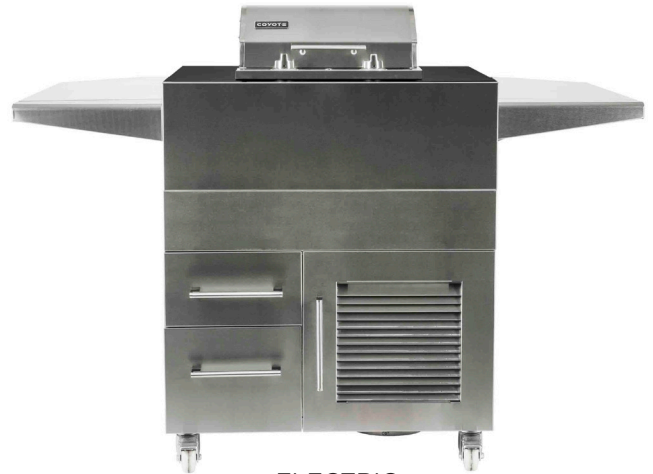
ELECTRIC GRILL ISLAND