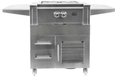
C2UNCT with POWER BURNER