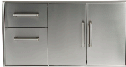
CCD-2DC 45" COMBO DOORS/DRAWERS