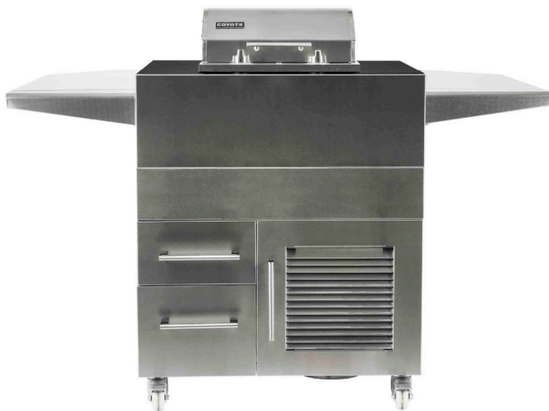
ELECTRIC GRILL ISLAND