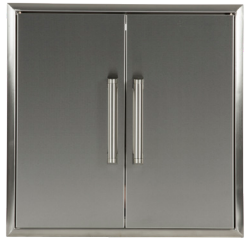
CDA2426 24"X26" DOUBLE DOOR