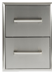
CPOD PULLOUT DRAWER Holds standard propane tank